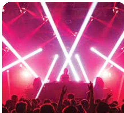
Disco Nights Disco Nights