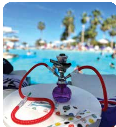
‘Tel Aviv’ Beach Party