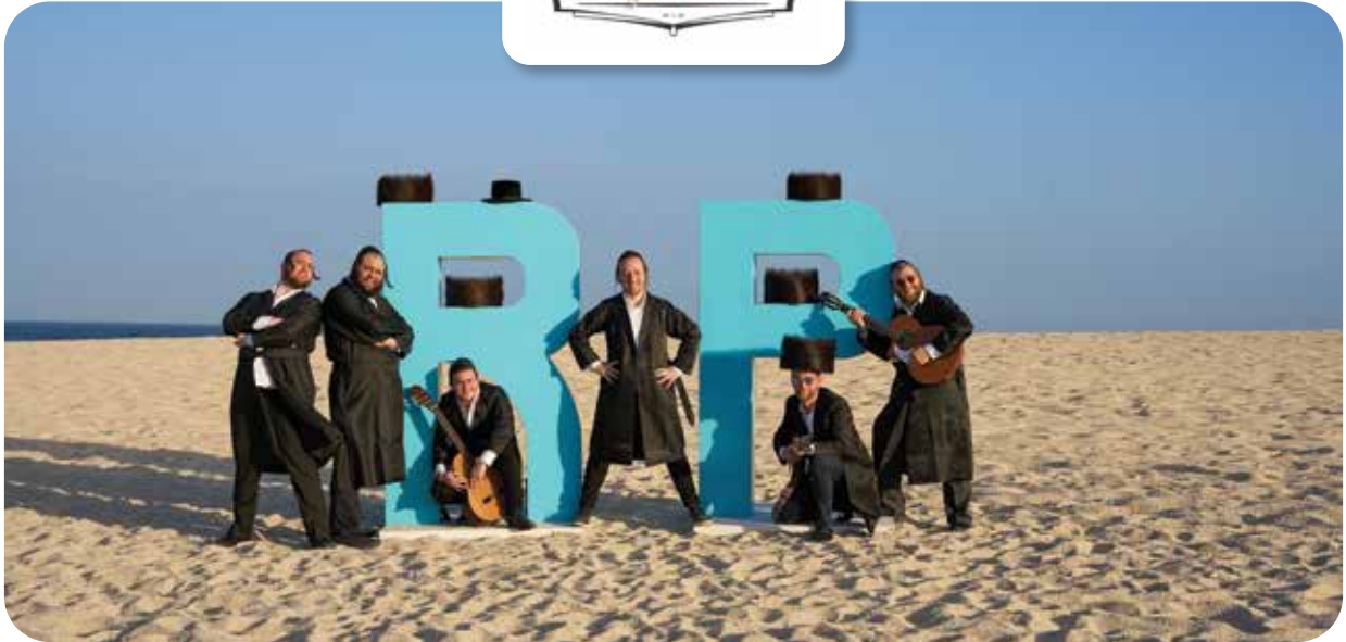
The Royal Choir