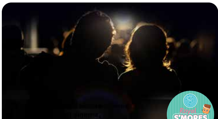
Moonlight Cinema & S'mores