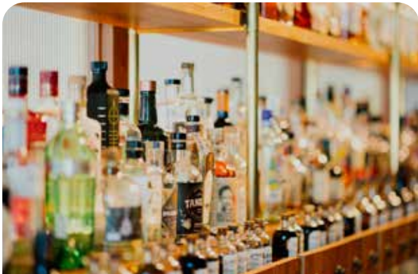
Full Alcohol Bar