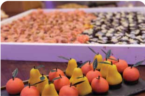
Late Night Tea Room